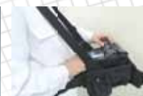
④ Working Belt in Action