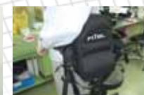
④ Working Belt as Shoulder Pack