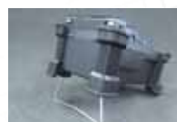
③ Angled Stand in Action